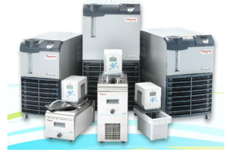
IET - Used Lab Equipment - Refurbished Analytical Laboratory Instruments

Global Service and Support: With our extensive global footprint, service and support are readily available by phone or the web.